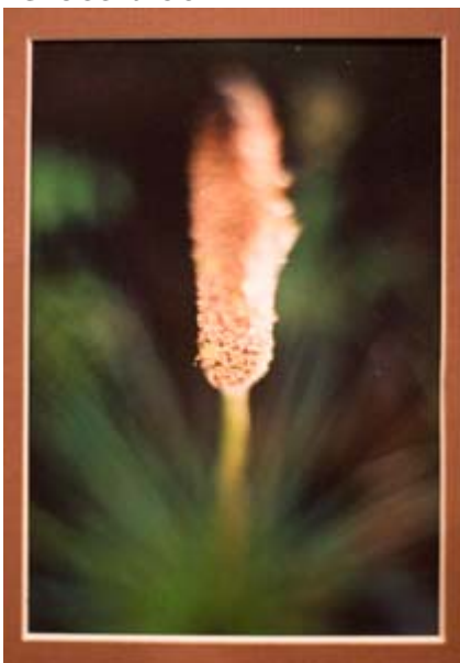
Highly commended: Stephen Nowicki Grass tree