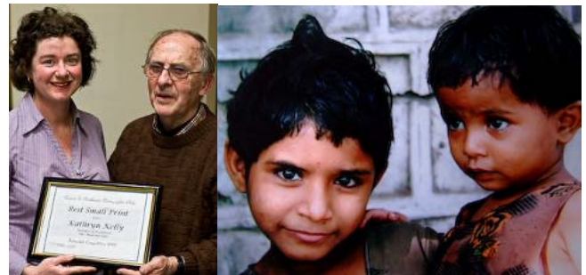
Best small print award