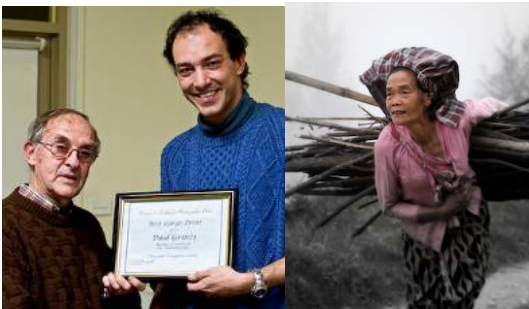
Best large print award

The only thing we didn't win was the overall night (they pipped us by a narrow margin). Well done to everyone – we were able to showcase at least one entry from each member who put photos forward for consideration. I've included a couple of photos from the night below: