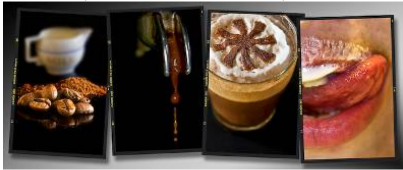
First place - Paul Grinzi