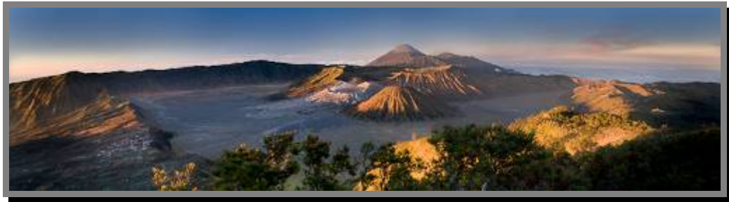
Bromo Caldera panorama