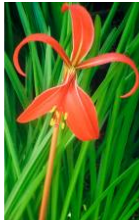
Natural Beauty Joe Gizzi