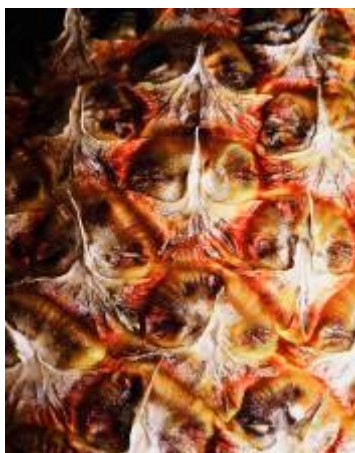
Pineapple Mathew Lasala