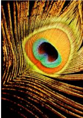
Eye of the peacock Joe Gizzi