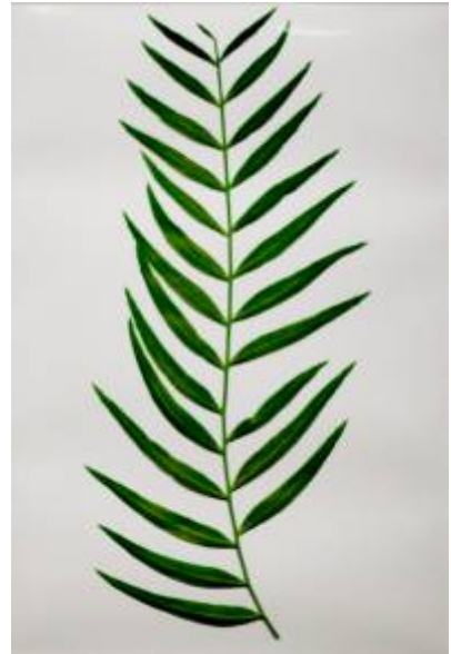
Peppercorn Second Place – Darce Cassidy