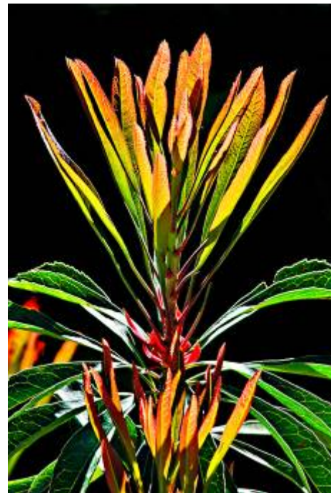
Translucent Third place – Darce Cassidy