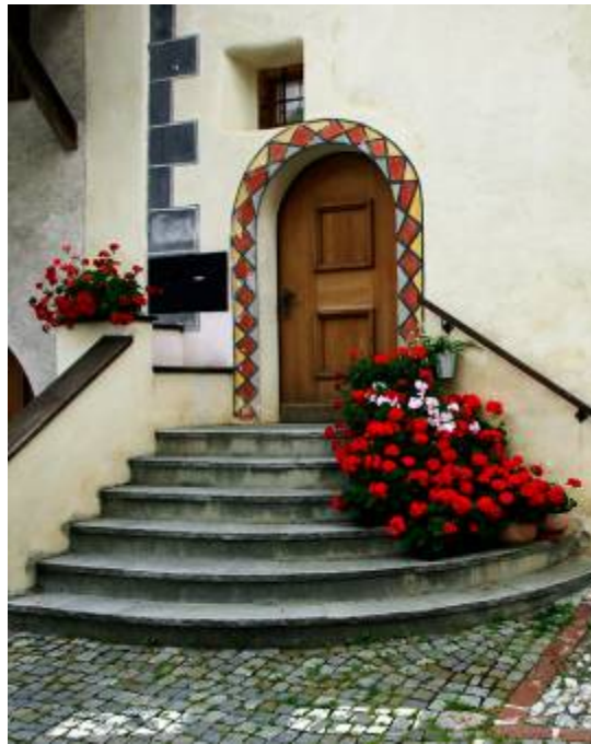
Red flowers on steps First place – Mathew Lasala