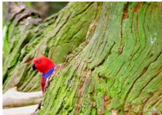
What are you up to? Clem Warren