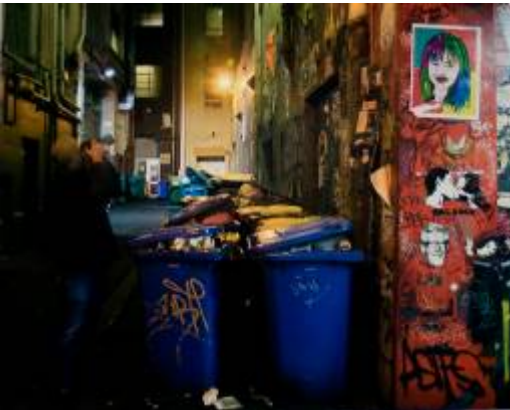
'Night photography' – Mathew LaSala