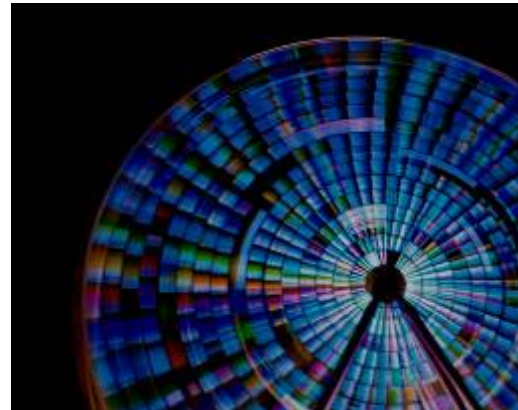
'Sky Wheel' – Fiona Woods