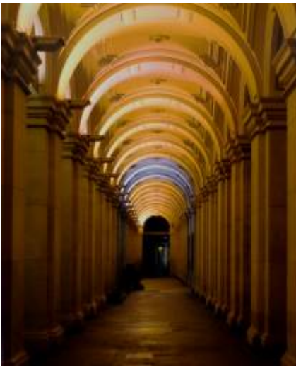
'GPO Arch at night' – Mathew LaSala