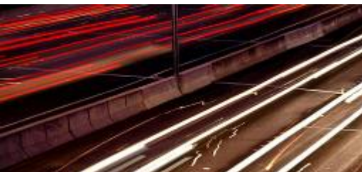
'Evening rush' – Fiona Woods