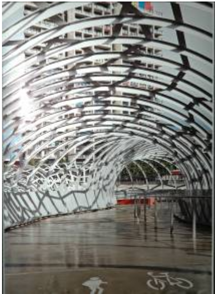
Shared path – Darce Cassidy