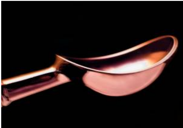
2 nd – Ice-cream Scoop - Clem Warren Sciocluna