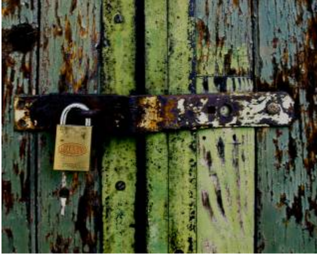
Lockwood – Mathew Lasala