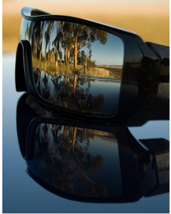
HC - 'Wayne Warren – ‘Double Vision’