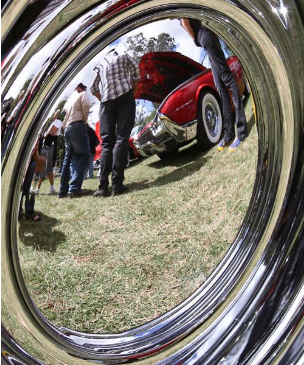
HC – Wayne Warren - 'Reflecting the past'